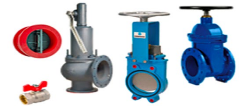
Figure1. b) Full-coated connection fittings (flaps)