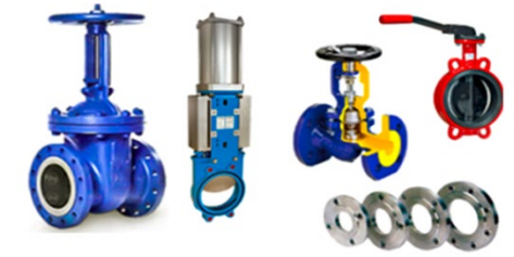
Figure1. a) The main types of shut-off valves, the most common and widely used in the oil and gas industry

Figure 1. a), b), c) some types of modern connecting fittings and their elements, which are often used by the oil and gas industry, are indicated.