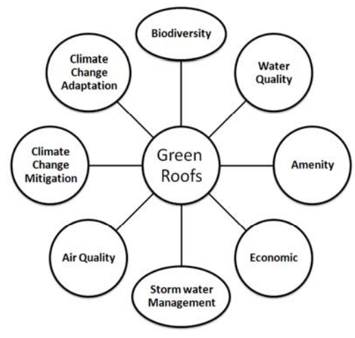
Figure 3. Benefits of Green Roofs

One of the most valuable features of green roof infrastructure is that it generates a wide range of social, economic and environmental benefits, both public and private. Many of these are still being qualified in different North America climate zones through both field tests and the use of modeling. Since each green roof installation is unique, the key to success is finding the right mix of benefits for a particular client and for their project. The following describes some of the selling points of green roofs. Green roofs can provide numerous benefits, some of which are outlined in the diagram below (Figure 3):