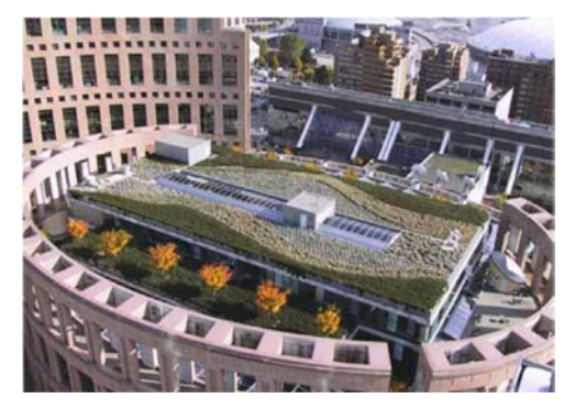
Figure 2. Green roof

These green roof layers can be adjusted or enhanced based on the needs of the designer or building owner. Typically, green roofs are classified as either extensive or intensive. Extensive green roofs tend to be lighter, require less maintenance but are not designed to be accessible green spaces. Intensive green roofs use more growing medium and can support a wider variety of plants and landscape designs. They can take the form of elaborate gardens or landscapes on a roof, even incorporating features such as wetlands and hills. In general, they are often designed to be accessible as green space in an urban area. The differences in weight, cost, structural preparation, water retention, predicted thermal benefit and public versus private benefits are particular in note (Figure 2).