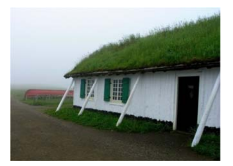
Figure 1. French fisherman's cottage fort, Louisbourg, Nova Scotia, Canada

However in the 1960's, rising concerns about the degraded quality of the urban environment and the rapid decline of green space in urban areas, renewed interest in green roofs as a "green solution" was sparked in Northern Europe. New technical research was carried out, ranging from studies on root-repelling agents, membranes, drainage, lightweight growing media, to plant suitability (Figure 1).