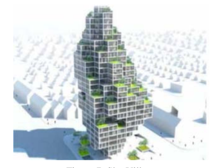
Figure 7. Sky Village

The base of the village was kept small in order to minimize the building's footprint as well as to maximize the public plaza and adjacent park. Retail space and restaurants take up the slim lower floors, offices are situated in the intermediary levels, and residential units are terraced towards the north to give the building a curved profile. These terraces give each residential unit a sky garden with a sunny southern aspect. Finally a hotel sits at the top of the high rise with views towards central Copenhagen (Figure 7).