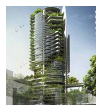
Figure 6. Singapore's ecological EDITT tower

Publicly accessible ramps will connect upper floors to the street level lined in shops, restaurants and plant life.