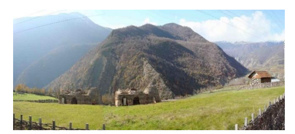
Figure 3. Remnants of Historic building in Maryan [4]

The preplanned excavation of this large graveyard with an approximate area of 250-300 acres has been done after the Islamic revolution in 1999 under new supervision. This site is a collection of graveyards in short distances to each other. This means that in different periods with establishment of a residential district, its graveyard has been also built next to it. The studies on the unearthed objects indicate that these graveyards belong to 2<sup>nd</sup> half of the 2nd millennium and continued to the Sassanid era (One of the famous Persian ancient empire).