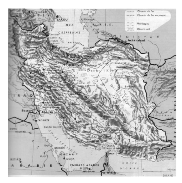
Figure 1. Geomorphologic structure of Iran [15]

Zagros) are much higher where surrounding a vast territory with Islberg-type peaks and wide plains forming an upper-lower correlated systems Figure 1 [1].