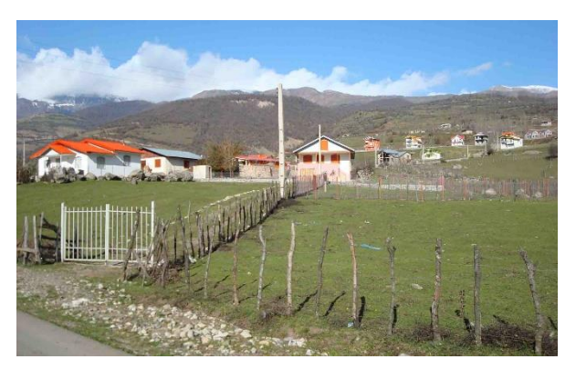
Figure 5. Changing the cultural landscape of Maryan lead to destroy valuable natural resources [4]

For sure, with the presence of human and consequently his changes in the natural resource of Maryan area, the ecological intrusion has started Figure 5 [9].