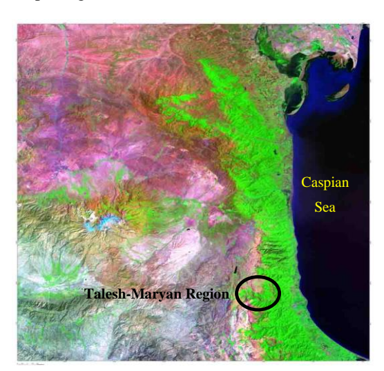
Figure 2. Satellite image of Talesh Mountain and archeological human habitats (Maryan) in inter mountain plains area in the east of Caspian Sea [8]

The native plants of Talesh mountainous region and main river valley named Karaganrud river, have provided various plants cover in different heights from the low lands up to the highest level ranging from herbs to provender and from cover crops to shrubs and trees. Middle part of this mountain range, known as "High Talehs" -where Maryan's ancient villages have placed - has specific natural and geomorphologic features [4].