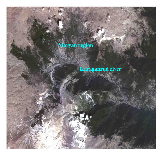
Figure 7. Natural structure of Talesh- Maryan region in this satellite image, basin of "Karganrud" river and mountainous plains` settlements especially Maryan region are to see [9]

In this study, satellite data processing and image analysis as a modern technology have been applied besides field studies and environmental interpretations together with different scientific data such as geology, botany, hydrology, archaeology and etc. Figure 7.