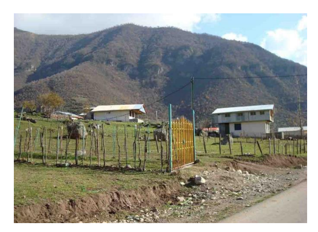
Figure 4. New modern construction between the archeological remnants [8]

For sure, with the presence of human and consequently his changes in the natural resource of Maryan area, the ecological intrusion has started Figure 5 [9].