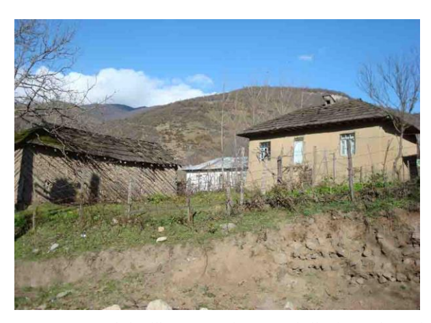
Figure 6. An archaic village cottage in Maryan built of natural material and in agreement with nature

Contemporarily, Maryan region's landuse and landscape have drastically changed due to alteration in people's lifestyle from agriculture and livestock breeding and their migration from mountainous districts to lowland and urban living.