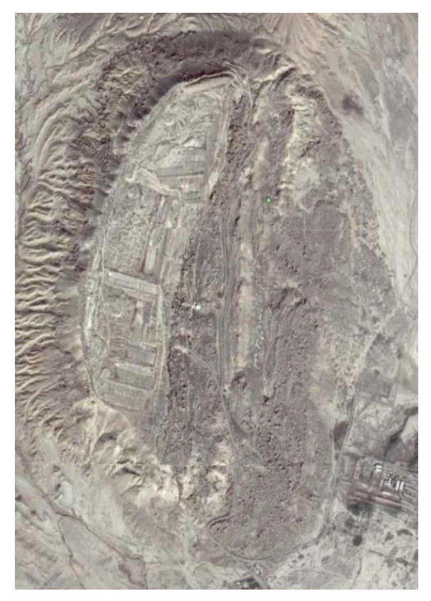
Figure 2. Top view of the selected area [6]

It is intending to propose actual architectural design in the selected area with use of space technology in the next step of investigations.