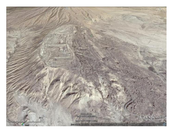
Figure 3. A view of the area with orientation South-North [6]