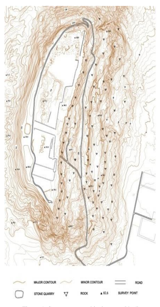
Figure 1. Stereo topographical survey [4, 5]

Figure 1 reflects of the map based on the method described above [4,5]. Figures 2-4 space images used for selected area with a different unglues and views integrated to the stereo topographic data [6].