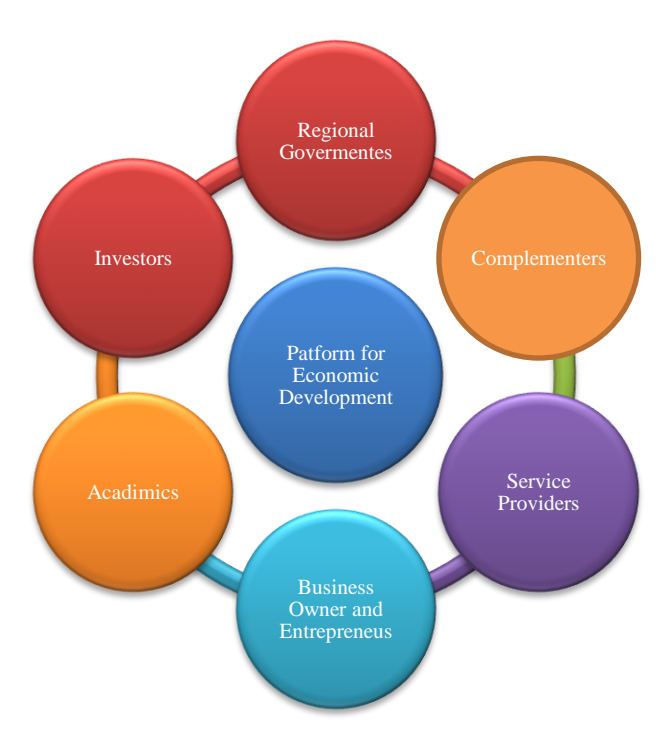
Figure 1. A new concept of economic development [2]

clients and team members with regard to matters like the sharing of objectives and values, peer assessment, and client expectations [12], and partnering, as well as an evaluation of the project's progress in meeting those expectations. A related method for managing the quality buildup in engineering or construction projects is called "obtained quality". This method is used to manage the quality buildup in a project during the design and construction phases of the project [13].